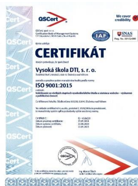
The VŠ DTI Certificate on the Introduction and Implementation of the Quality Management System according to the new ISO 9001:2015 Standard

The Certificate on the Introduction and Implementation of the Quality Management System according to the new ISO 9001:2015 Standard is successfully defended by the VŠ DTI every year.